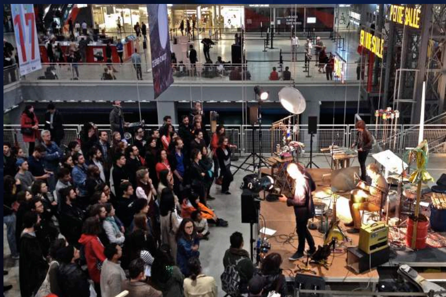
Center Pompidou - Sound Festival # 3 - May 18, 2017